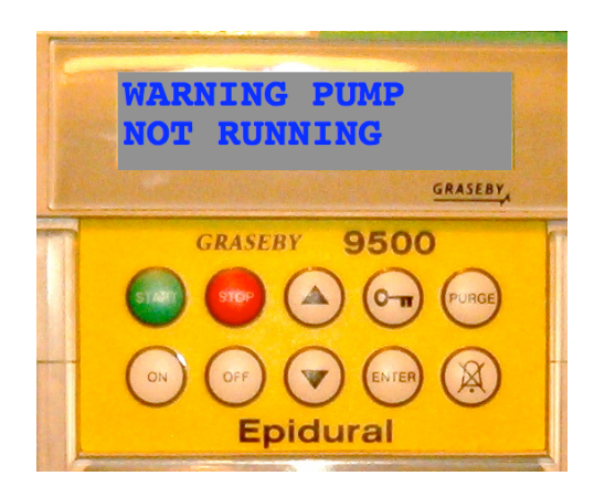
Fig. 1. Partial screen shot of the simulation—a user can mouse click on the buttons, which are animated to give simple visual feedback of pressing. Note that graph theory does not address all HCI issues, such as the naming or confusibility of buttons.

are no dead-ends, and no unreachable states. The Graseby is indeed strongly connected.